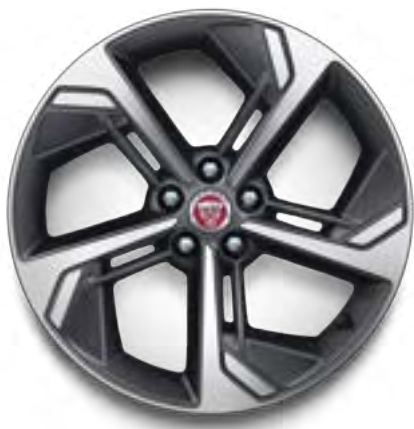
19" Style 5119, 5 spoke, Satin Dark Grey Diamond Turned finish