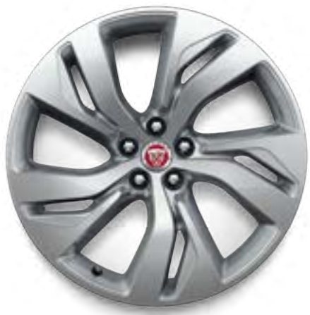
20" Style 5120, 5 spoke, Chrome Shadow