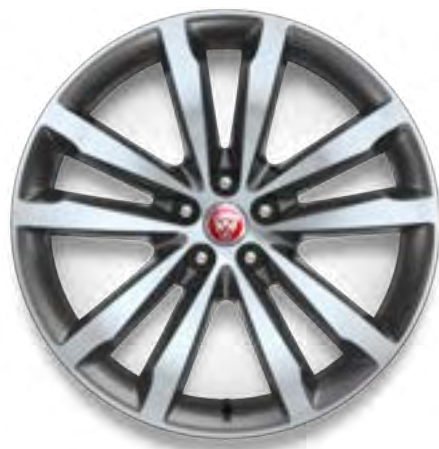
20" Style 5051, 5 split-spoke, Satin Grey Diamond Turned finish