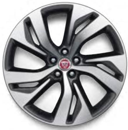
20" Style 5120, 5 spoke, Satin Grey Diamond Turned finish