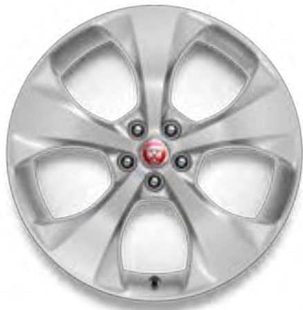
20" Style 5054, 5 spoke, Gloss Sparkle Silver

Personalise your vehicle with a selection of alloy wheels featuring a wide range of contemporary and dynamic designs.