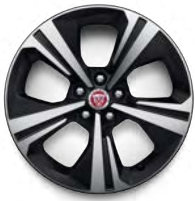
18" Style 5118, 5 spoke, Satin Black Diamond Turned finish