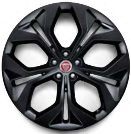
21" Style 5053, 5 split-spoke, Gloss Black