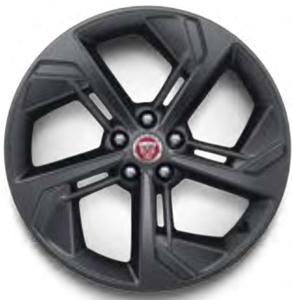
19" Style 5119, 5 spoke, Satin Dark Grey