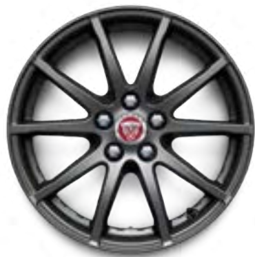
17" Style 1005, 10 spoke, Satin Dark Grey

Personalise your vehicle with a selection of alloy wheels featuring a wide range of contemporary and dynamic designs.