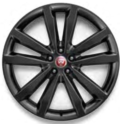
20" Style 5051, 5 split-spoke, Gloss Black