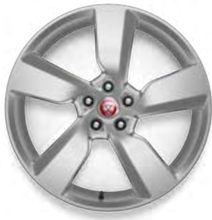
19" Style 5049, 5 spoke, Gloss Sparkle Silver