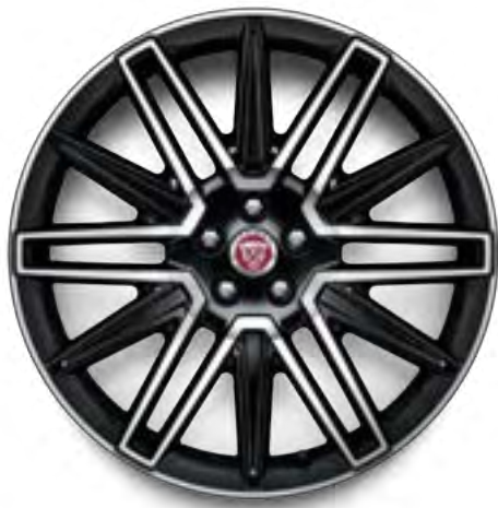
21" Style 1078, 12 split-spoke, Gloss Black Diamond Turned finish