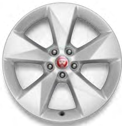
18" Style 5048, 5 spoke, Gloss Sparkle Silver