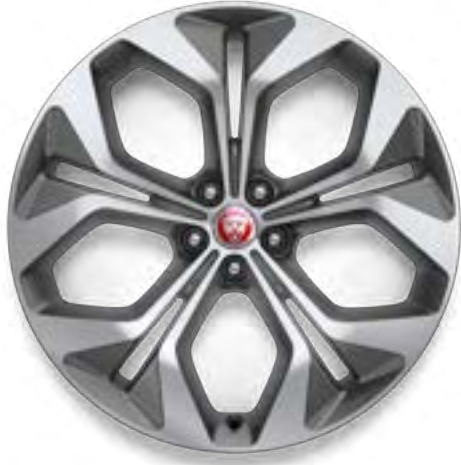
21" Style 5053, 5 split-spoke, Satin Grey Diamond Turned finish