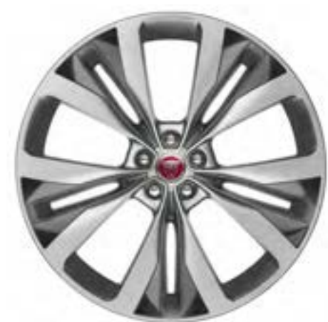
22" Style 1020, 15 spoke, Gloss Silver with contrast inserts