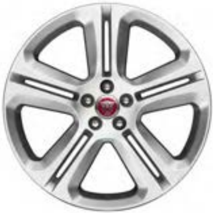
20” Style 5036, 5 split-spoke, Gloss Sparkle Silver