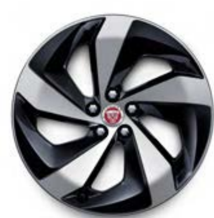
21" Style 7024, 7 spoke, Gloss Black Diamond Turned finish