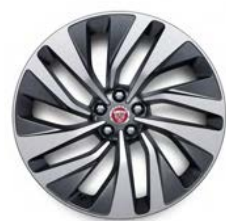
21" Style 1068, 10 spoke, Satin Dark Grey with contrast Diamond Turned finish

Personalise your vehicle with a selection of alloy wheels featuring a wide range of contemporary and dynamic designs.