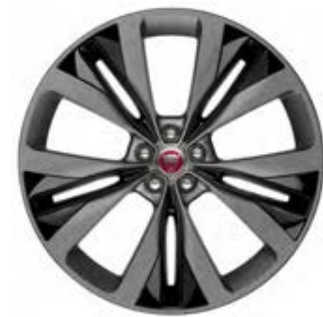
22" Style 1020, 15 spoke, Gloss Grey with contrast inserts