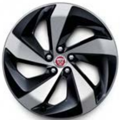
19” Style 5103, 5 spoke, Gloss Black with contrast Diamond Turned finish