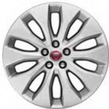
18” Style 1021, 10 spoke, Gloss Sparkle Silver

Personalise your vehicle with a selection of alloy wheels featuring a wide range of contemporary and dynamic designs.