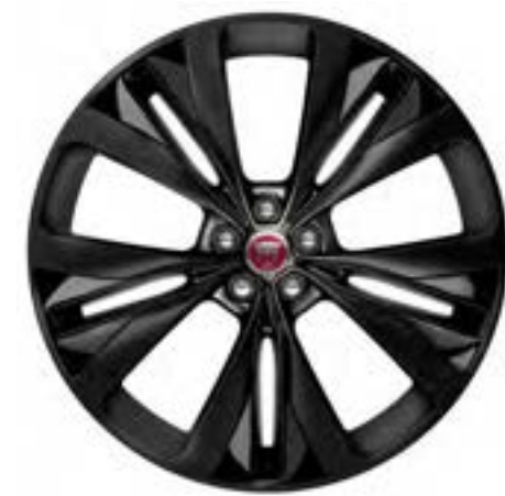
22" Style 1020, 15 spoke, Gloss Black with Satin Black inserts