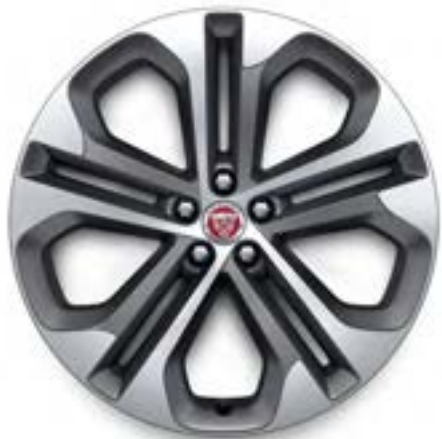
21” Style 5104, 5 split-spoke, Satin Dark Grey with contrast Diamond Turned finish