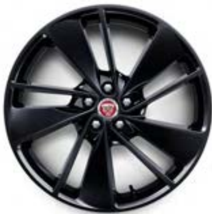
20” Style 1067, 10 spoke, Gloss Black