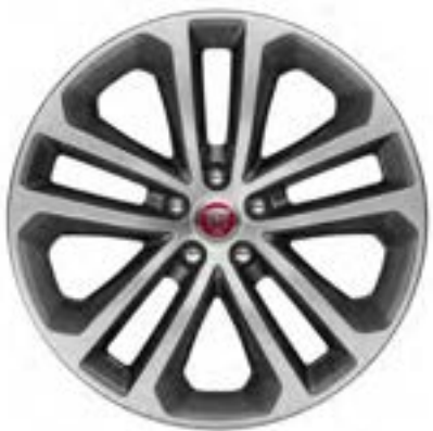
19” Style 5038, 5 split-spoke, Gloss Grey with contrast Diamond Turned finish