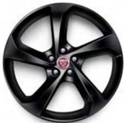
19” Style 5037, 5 spoke, Gloss Black