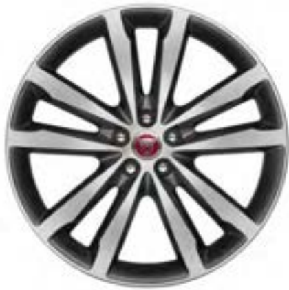
20” Style 5031, 5 split-spoke, Gloss Grey with contrast Diamond Turned finish