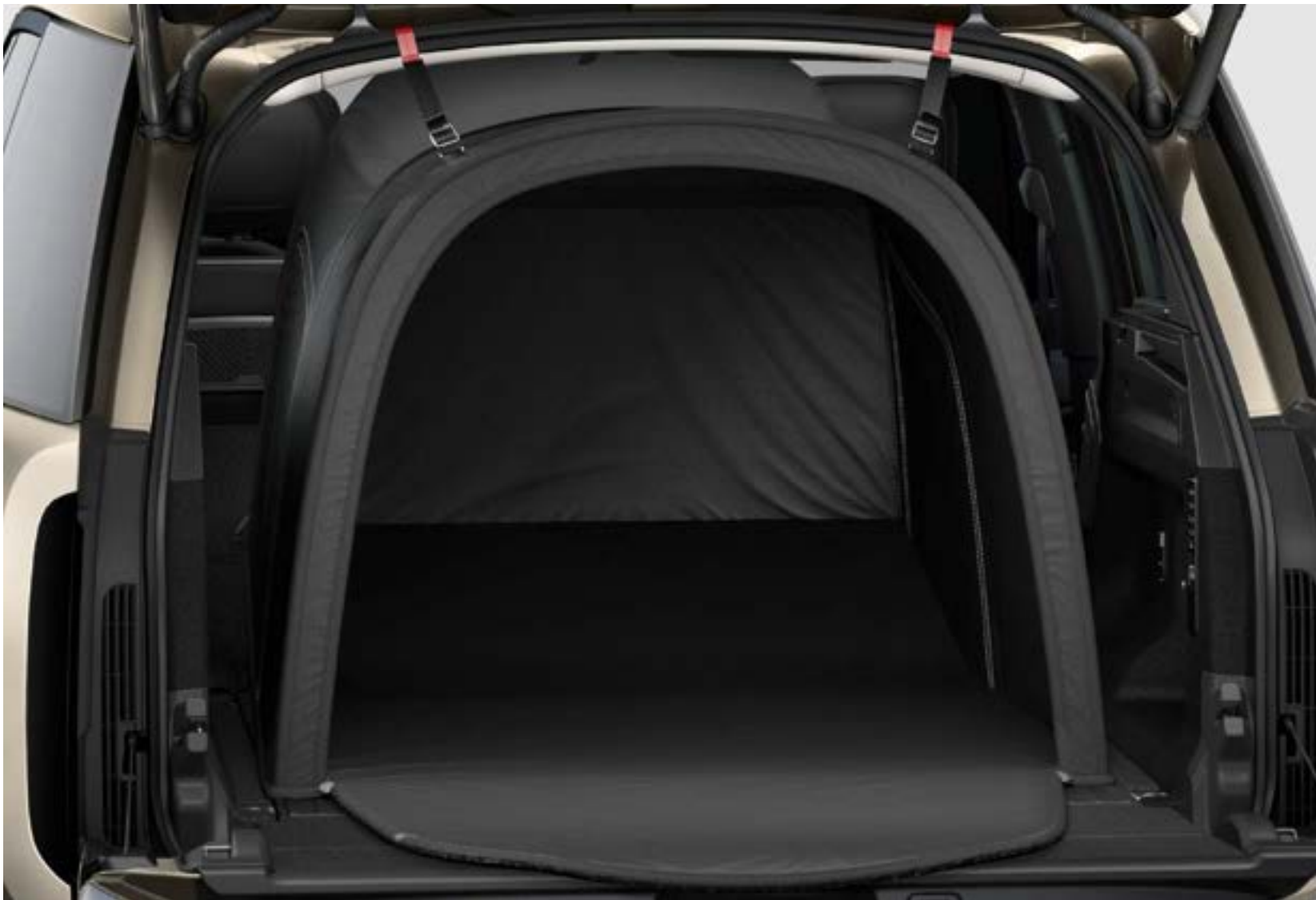
Loadspace Full Protection Liner

The ideal solution to fully protect the loadspace when transporting large or dirty items. It is designed to cover sides, roof lining and loadspace floor and provides full protection from wet or muddy items like boots, garden waste, or leisure equipment. When loading, the padded panel drops down and acts as a bumper protector. The liner anchors securely to the loadspace 'D' loops to keep it in place and is designed to keep bulky objects hidden from view. A side zip allows easy access to the loadspace area..