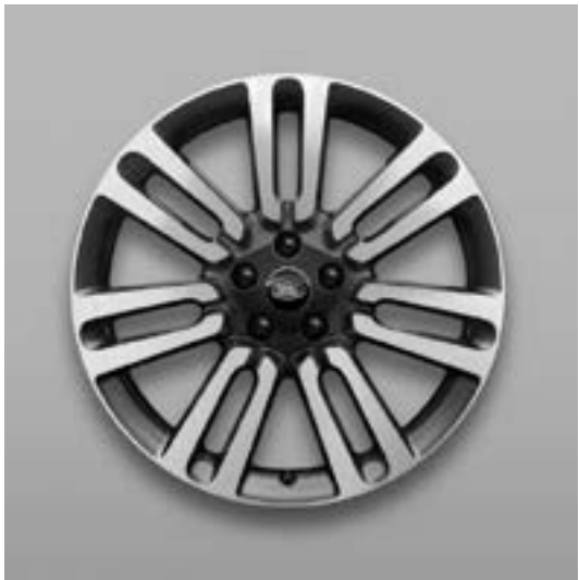
21" Style 7021, Diamond Turned with Dark Grey contrast