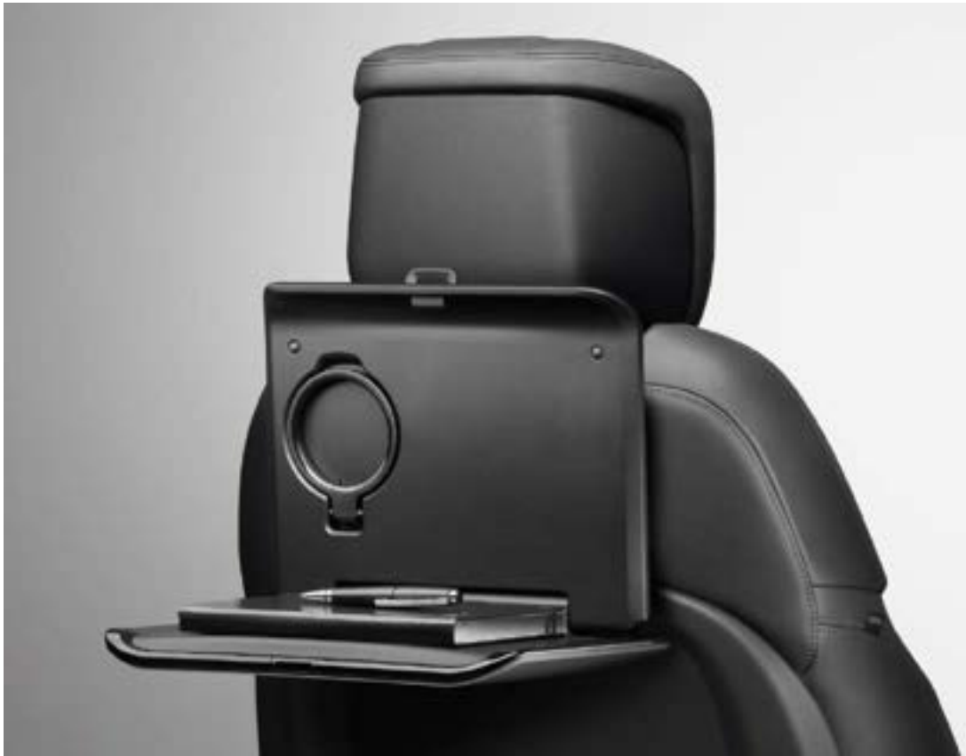
Click and Work The Click and Work is part of the Click and Go range. This folding table offers the rear passengers a practical surface from which to work, particularly useful on long journeys. It also has a cup holder and is height and angle adjustable for in-cabin comfort.