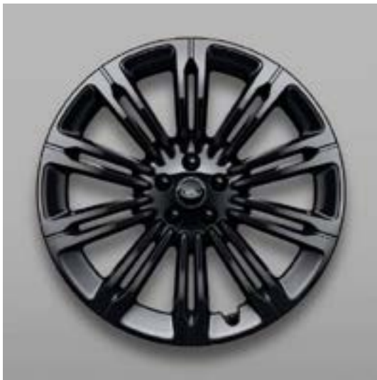
23" Style 1075, Gloss Black