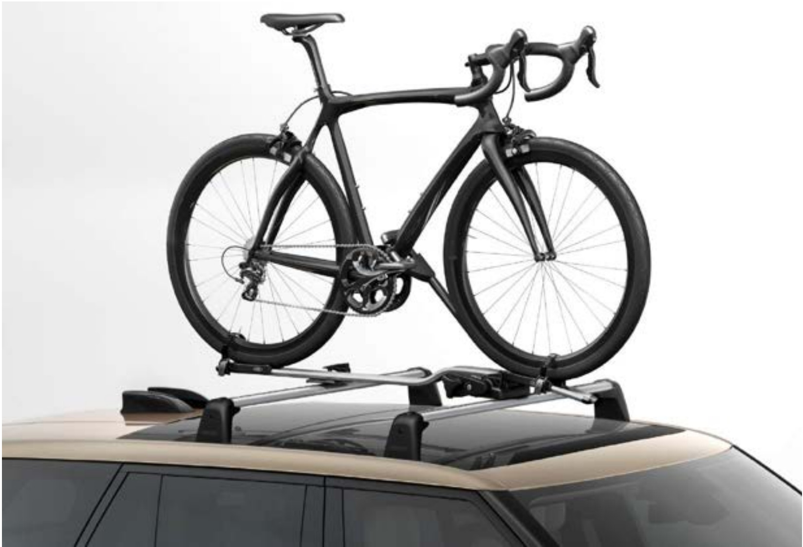
Roof Mounted Cycle Carrier, Wheel Mounted

A roof mounted cycle carrier which mounts easily onto the cross bars, with quick-release wheel straps for convenient loading and unloading. It is a premium product, which has been tested to industry leading durability and safety standards including TUV certification (European technical inspection). Securely keeps the bike in place, with locks included for both bike to cycle carrier and cycle carrier to cross bars. Carries one bike per holder and a maximum of three carriers can be fitted. The maximum bike weight 20kg per carrier.