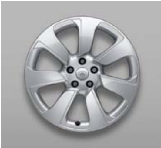
20" Style 7020