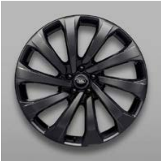
23" SV Bespoke Forged Style 1079, Black and Dark Grey Gloss