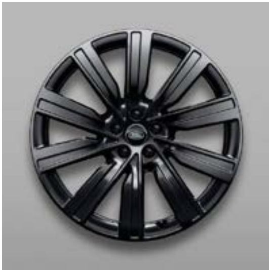
22" Style 1073, Gloss Black