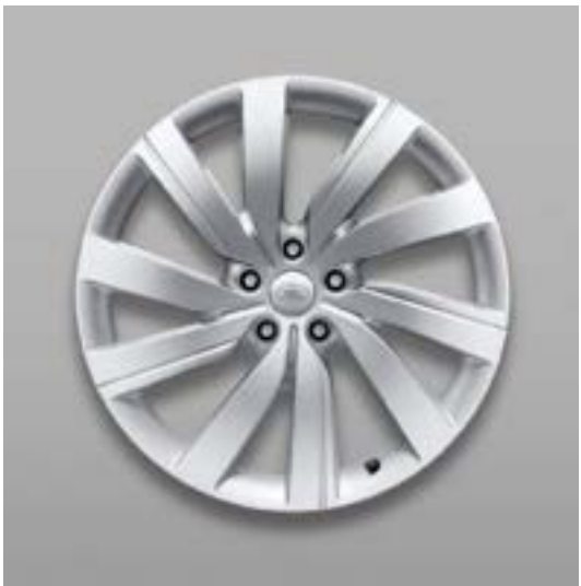
21" Style 5112