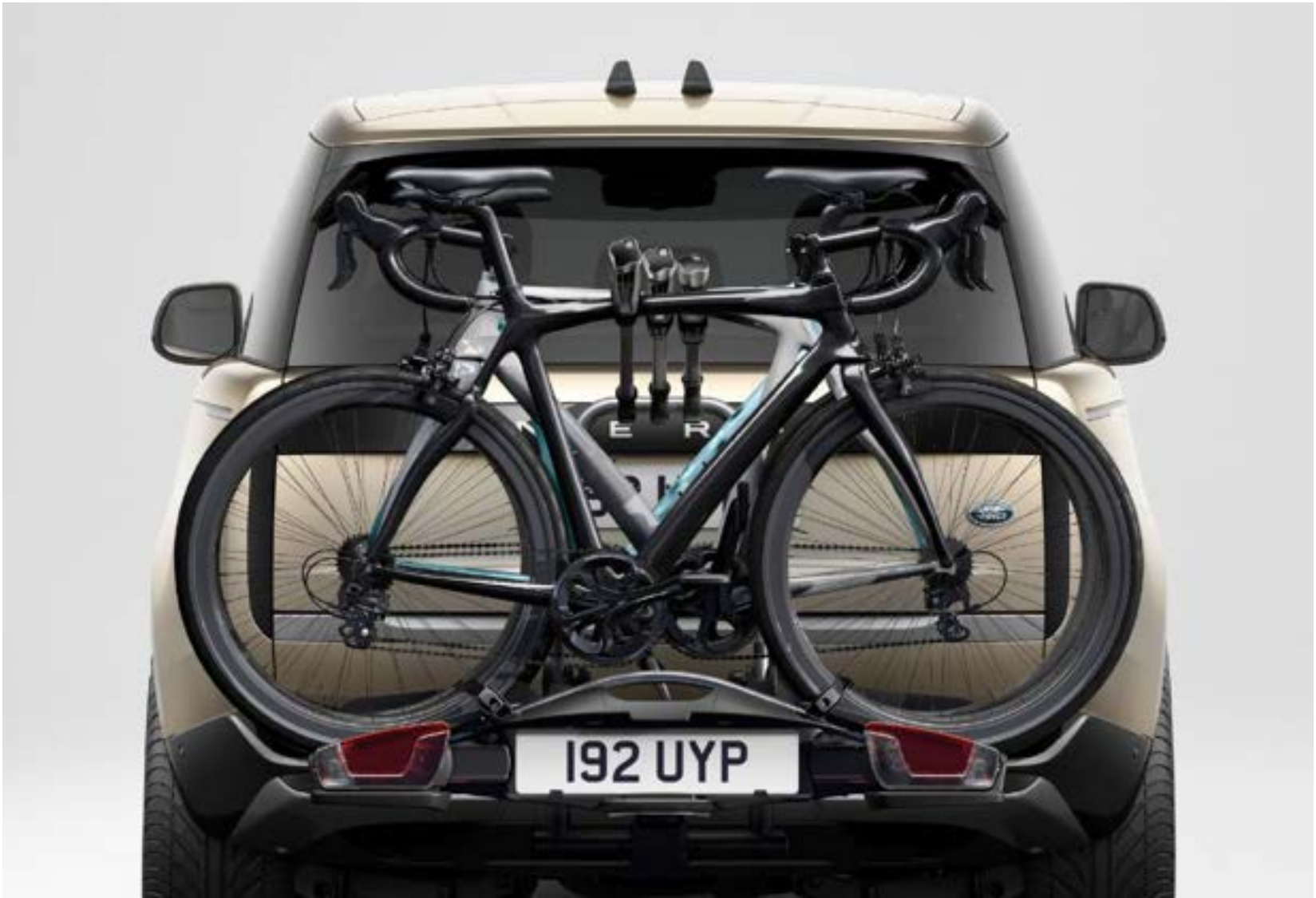
Tow Bar Mounted Cycle Carrier

A roof mounted cycle carrier which mounts easily onto the cross bars, with quick-release wheel straps for convenient loading and unloading. It is a premium product, which has been tested to industry leading durability and safety standards including TUV certification (European technical inspection). Securely keeps the bike in place, with locks included for both bike to cycle carrier and cycle carrier to cross bars. Carries one bike per holder and a maximum of three carriers can be fitted. The maximum bike weight 20kg per carrier.