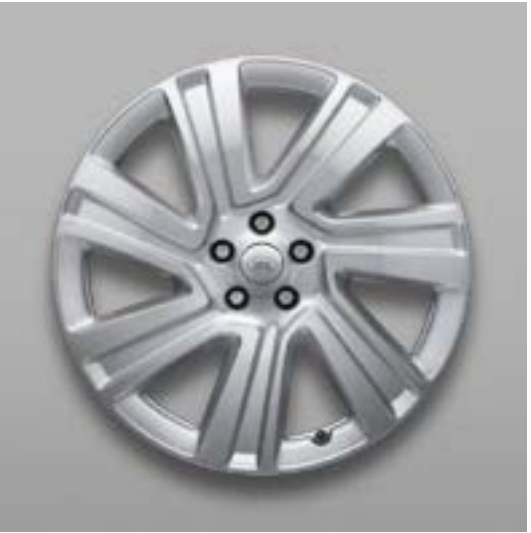
22" Style 7023