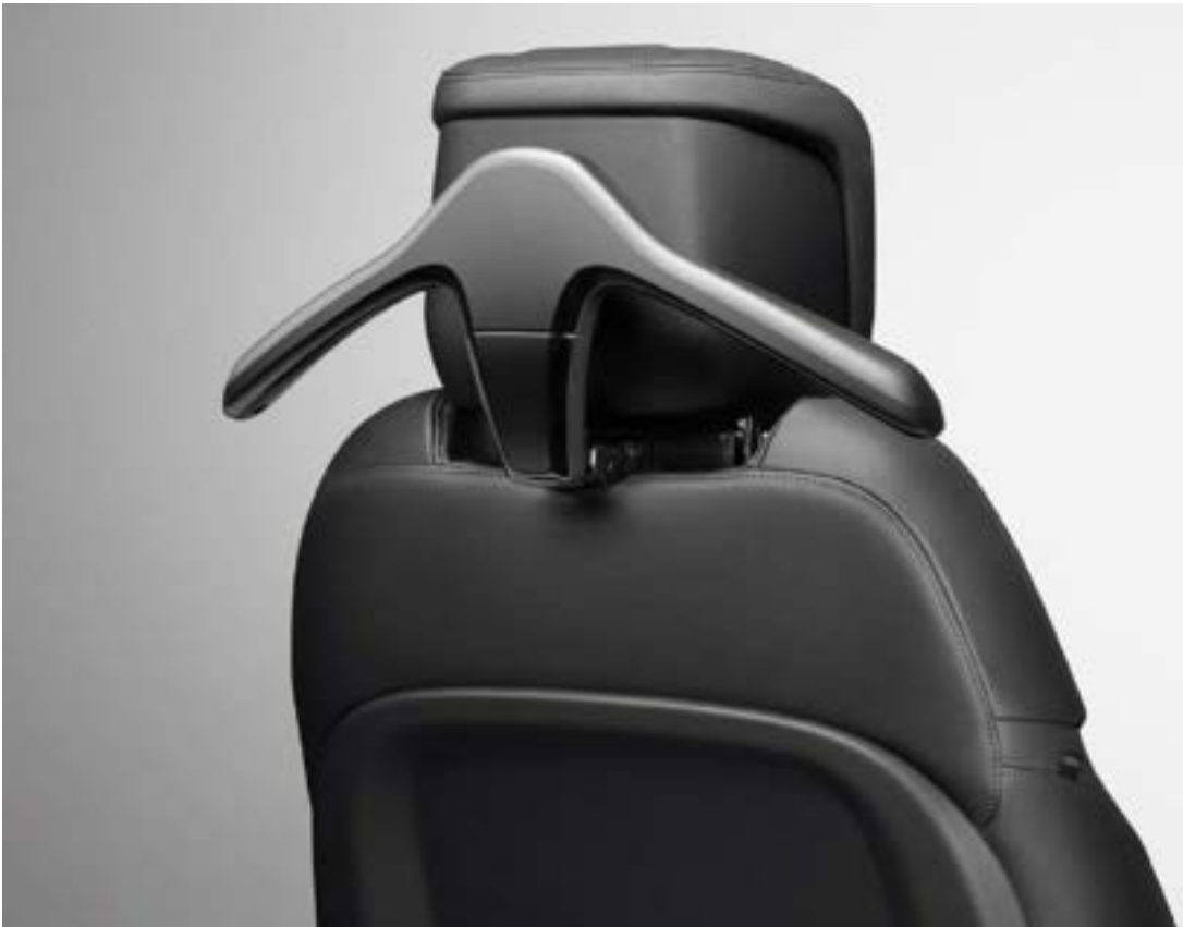
Click and Hang The Click and Hang is part of the Click and Go range. This removable coat hanger allows shirts or jackets to be kept crease-free whilst transporting. Also includes an integral hook for use outside the vehicle.