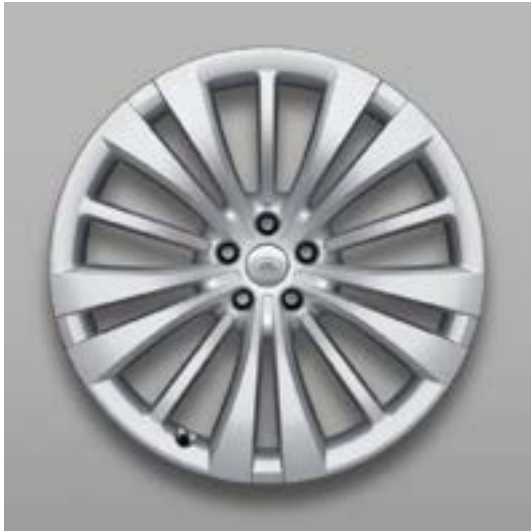
23" Style 1074