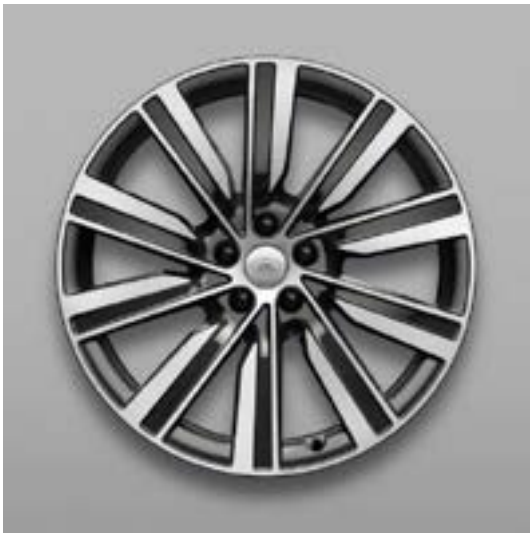
22" Style 1073, Diamond Turned with Dark Grey contrast