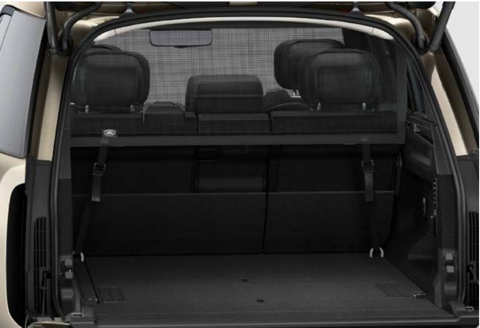
Loadspace Partition Net

The ideal solution to fully protect the loadspace when transporting large or dirty items. It is designed to cover sides, roof lining and loadspace floor and provides full protection from wet or muddy items like boots, garden waste, or leisure equipment. When loading, the padded panel drops down and acts as a bumper protector. The liner anchors securely to the loadspace 'D' loops to keep it in place and is designed to keep bulky objects hidden from view. A side zip allows easy access to the loadspace area..