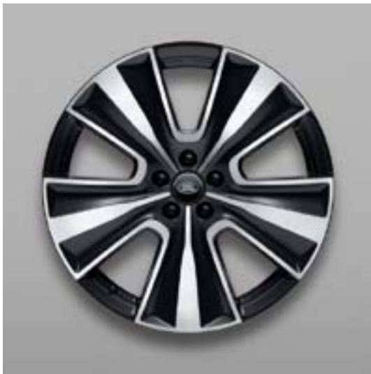
22" SV Bespoke Style 1072, Diamond Turned with Black contrast