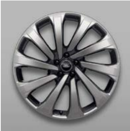
23" SV Bespoke Forged Style 1079, Titan Silver and Dark Grey Gloss