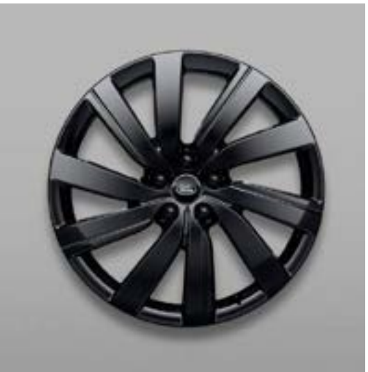
21" Style 5112, Gloss Black