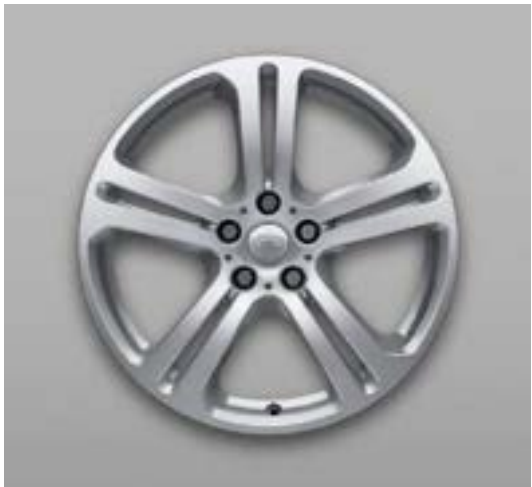
20" Style 5134

Personalise your vehicle with a selection of alloy wheels featuring a wide range of contemporary and dynamic designs.