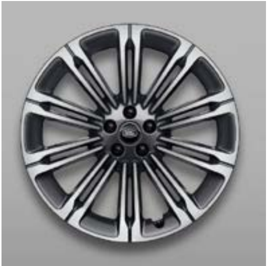
23" Style 1075, Diamond Turned with Dark Grey contrast