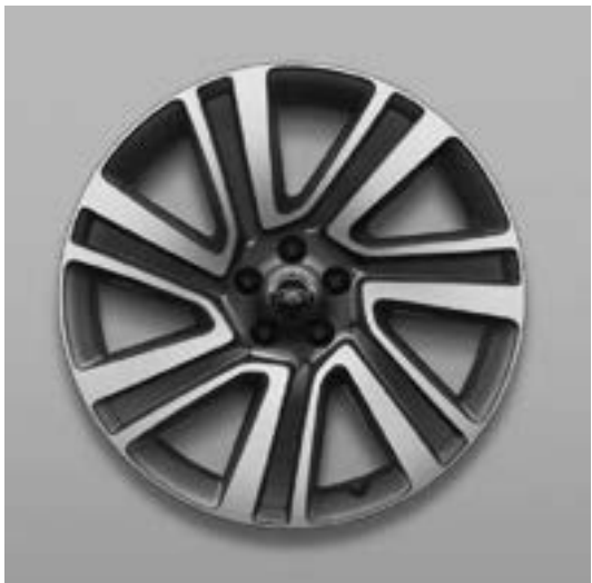
22" Style 7023, Diamond Turned with Dark Grey contrast

Personalise your vehicle with a selection of alloy wheels featuring a wide range of contemporary and dynamic designs.