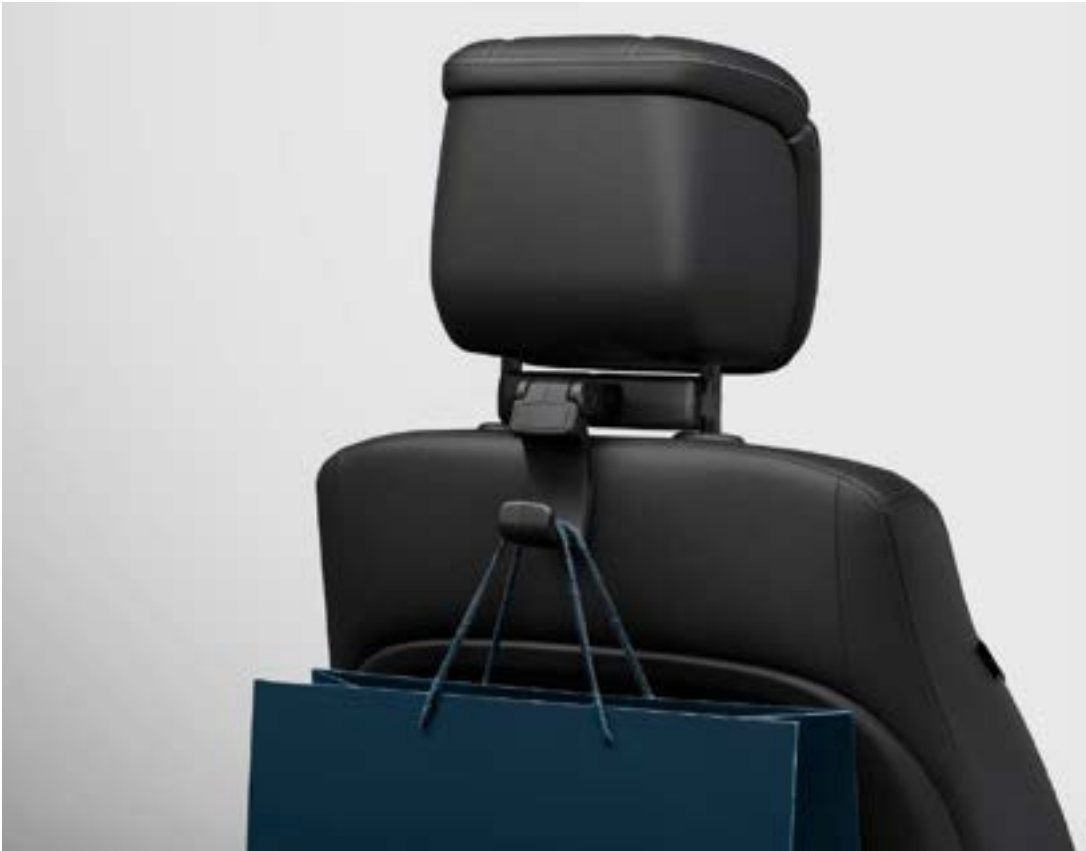
Click and Hook The Click and Hook is part of the Click and Go range. This universal hook creates extra storage space for items to be hung, especially useful for handbags or groceries.