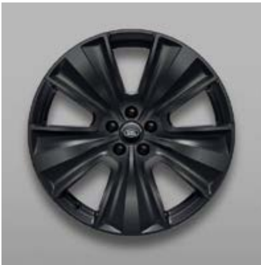
22" SV Bespoke Style 1072, Satin Black