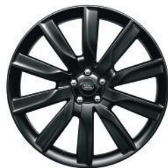
21" 10 Spoke, 'Style 1033' with Gloss Black Finish