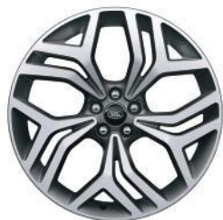
21" 5 Split-Spoke, 'Style 5047' with Diamond Turned Finish