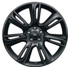
20" 7 Spoke, 'Style 7014' with Gloss Black Finish