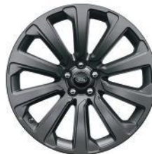
20" 10 Spoke, 'Style 1032' with Satin Dark Grey Finish