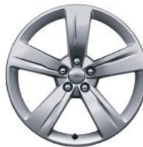
19" 5 Spoke, 'Style 5046'