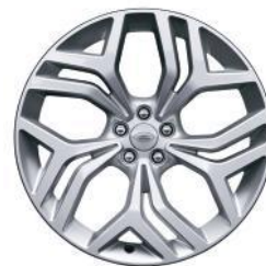
21" 5 Split-Spoke, 'Style 5047'