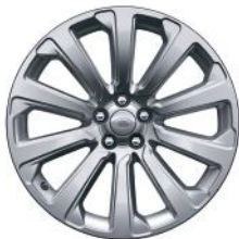
20" 10 Spoke, 'Style 1032'