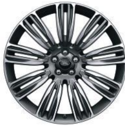
22" 9 Split-Spoke, 'Style 9007' with Diamond Turned Finish