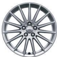
18" 15 Spoke, 'Style 1022'