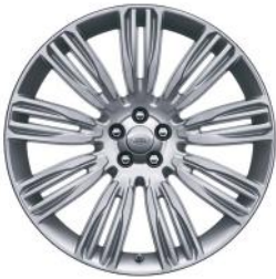
22" 9 Split-Spoke, 'Style 9007'