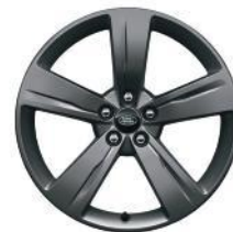
19" 5 Spoke, 'Style 5046' with Satin Dark Grey Finish