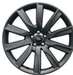
21" 10 Spoke, 'Style 1033' with Satin Dark Grey Finish