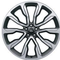
22" 10 Spoke, 'Style 1051' Diamond Turned with Satin Technical Grey Finish