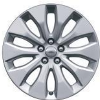
18" 10 Spoke, 'Style 1021'

Personalise your vehicle with a selection of alloy wheels featuring a wide range of contemporary and dynamic designs.