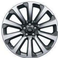
20" 10 Spoke, 'Style 1032' with Diamond Turned Finish