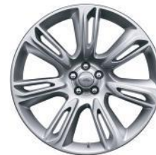
20" 7 Spoke, 'Style 7014'